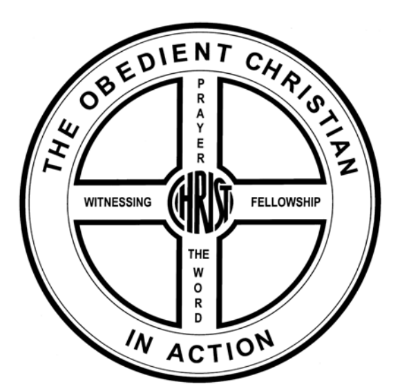
The Wheel Illustration